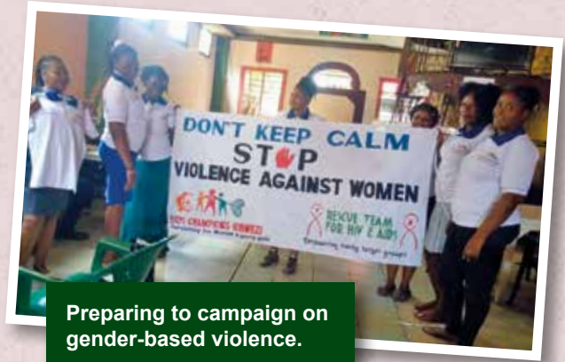
Preparing to campaign on gender-based violence.