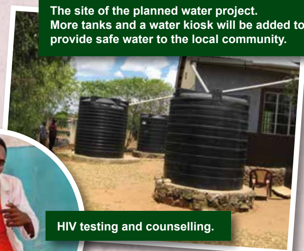
HIV testing and counselling.

The site of the planned water project. More tanks and a water kiosk will be added to provide safe water to the local community.