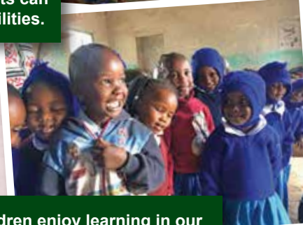
Children enjoy learning in our partner schools in Kenya.