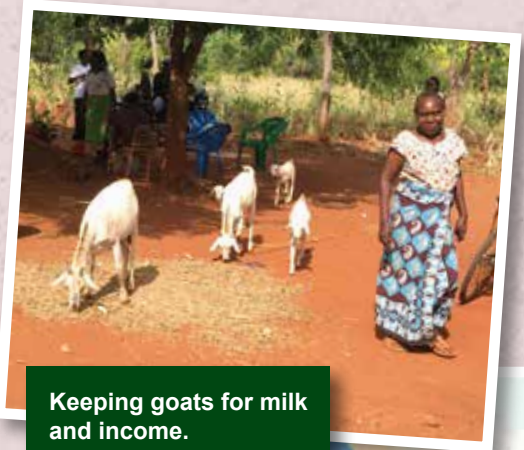
Keeping goats for milk and income.

£25 could provide a subsidised wheelchair for mobility and independence