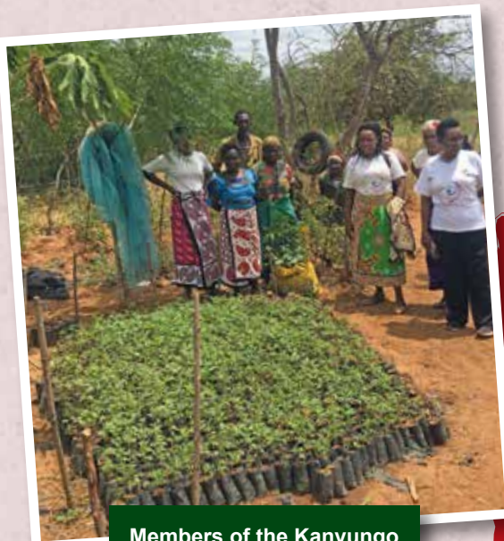
Members of the Kanyungu group at their tree nursery.