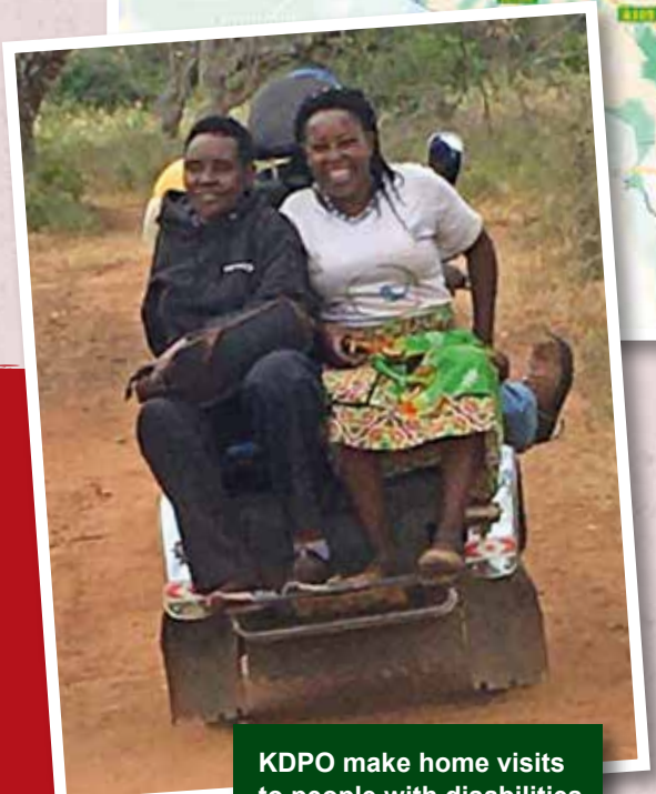
KDPO make home visits to people with disabilities