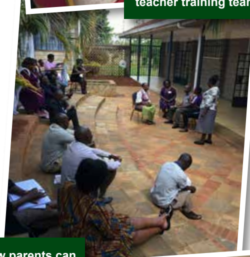
Using role play to train teachers how parents can support school-leavers with learning disabilities.