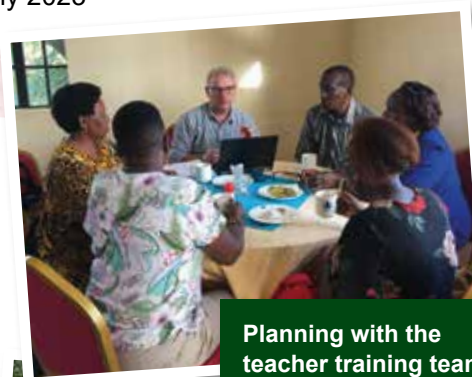
Planning with the teacher training team.

Life for most people in Kenya is harder than ever, and especially for the vulnerable families that Advantage Africa exists to support. During my trip I visited many such families and was reminded that with the absence of any meaningful welfare state, their major source of help is Advantage Africa and our partners. That's why your support is appreciated and valued, now more than ever.